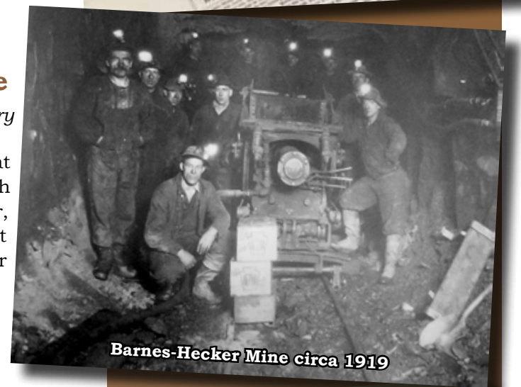
Barnes-Hecker Mine circa 1919