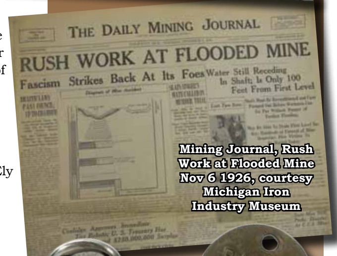
Mining Journal, Rush Work at Flooded Mine Nov 6 1926